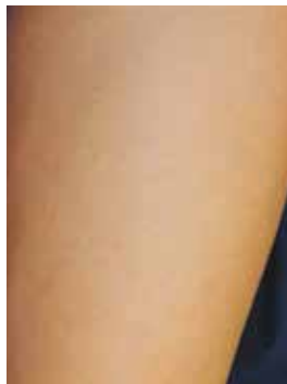
After 1 treatment