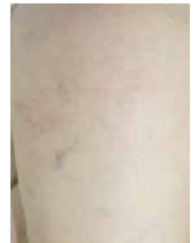
After 4 treatments