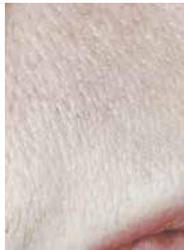
After 3 treatments