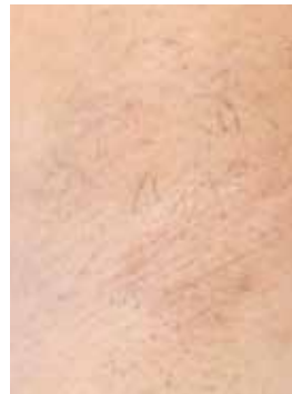
After 2 treatments